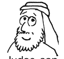
Judas son of James